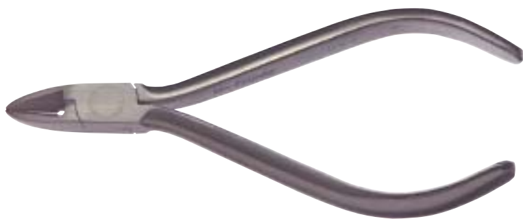
Micro-Mini Pin & Ligature Cutter ..... .80-678107 $174.99

You can find these products on page 380.