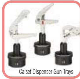
Calset Dispenser Gun Trays

Thermal Assisted Light Polymerization. Heat composite material to 98°F (37°C), 130°F (54°C), 155°F (68°C). Maintains constant temperature. Increases degree of cure. Shortens curing time by over 80%. Improves composite flow by 68%. Reduces micro-leakage. Improves physical properties. 120v AC.