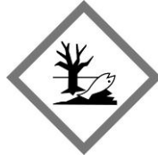
Danger Hazardous to aquatic life

Toxicity Data, Environmental Fate, Physical/Chemical Data, or other Data Supporting Environmental Hazard Statements: Water Hazard Class 2 (Self-assessment): Very toxic to fish. Do not allow product to reach ground water, water streams or sewage system. Also poisonous for fish and plankton in water bodies. R50/53 Very toxic to aquatic organisms may cause long-term adverse effects in the aquatic environment.